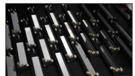
Extensive Application Area