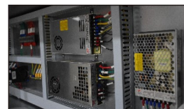
Strict Power System