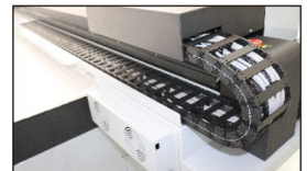
High Tenacity Tankrail