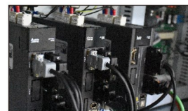
Industrial Servo Motor