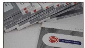
Automatic Color Chasing